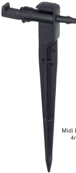
Midi Drip™ Spike 4mm Barb

Economical and precise watering of individual plants and trees with stable positioning of emitters in tubing or with spike.