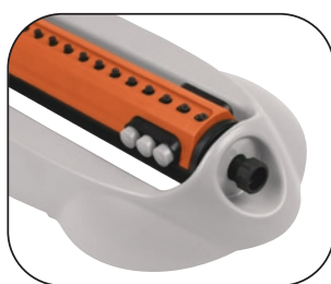
Buttons on side turn off.