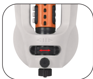
Adjustable dial mechanism to vary area watered.

Provides even coverage of rectangular area. Gear-drive operation with individual side adjustment. Vary the width by closing off up to 6 of the 20 nozzles. Covers approximately 20 x 18 metres. Connects to 12mm fittings.