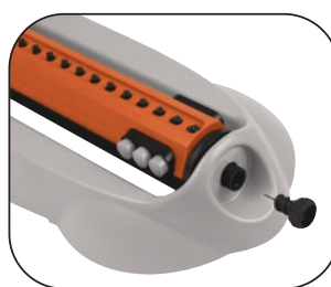
Unscrew nozzle needle-plug for cleaning spray tube.