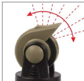
2. Adjust the hood to control spray distance